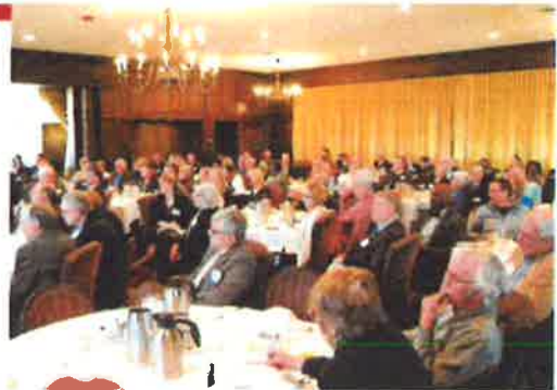
Our annual forum: pictured above, last year's forum. To the left; marketing for our upcoming forum in April. Below, students of GPH, who were involved with "Break the Cycle" film, pose at the forum.