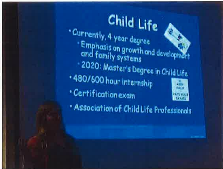
Vocational Talk at meeting