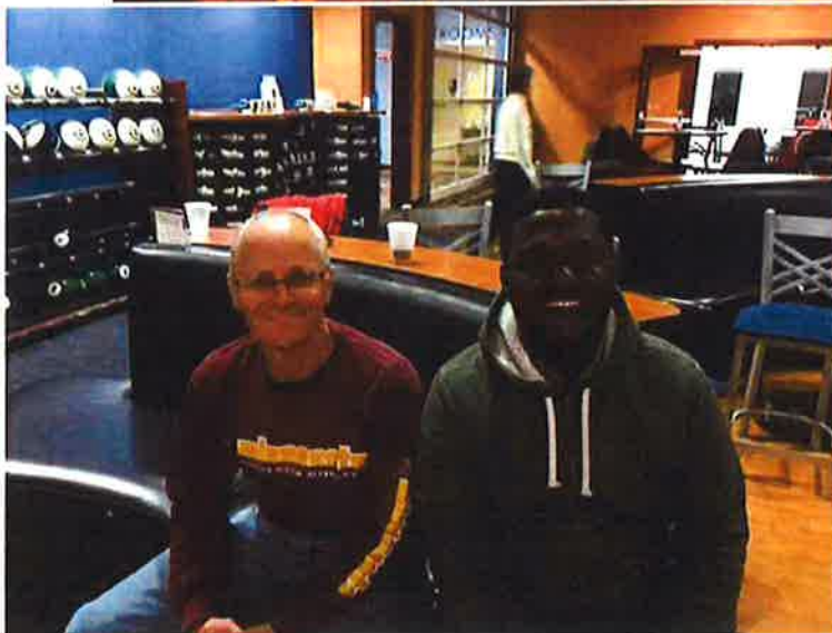
STRIVE bowling night